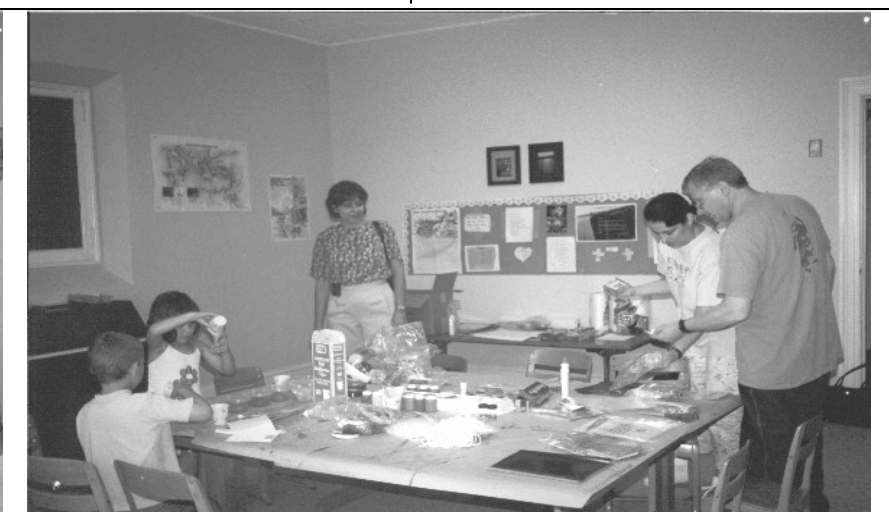
The Education Committee held its Church School Open House on Saturday the 11th of September. Many church members came to make new people feel welcome to our church. Pictured, members are getting the crafts room and popcorn machine ready for visitors. We were also very fortunate to have the popcorn machine available to us for refreshment hour after worship on Sunday.