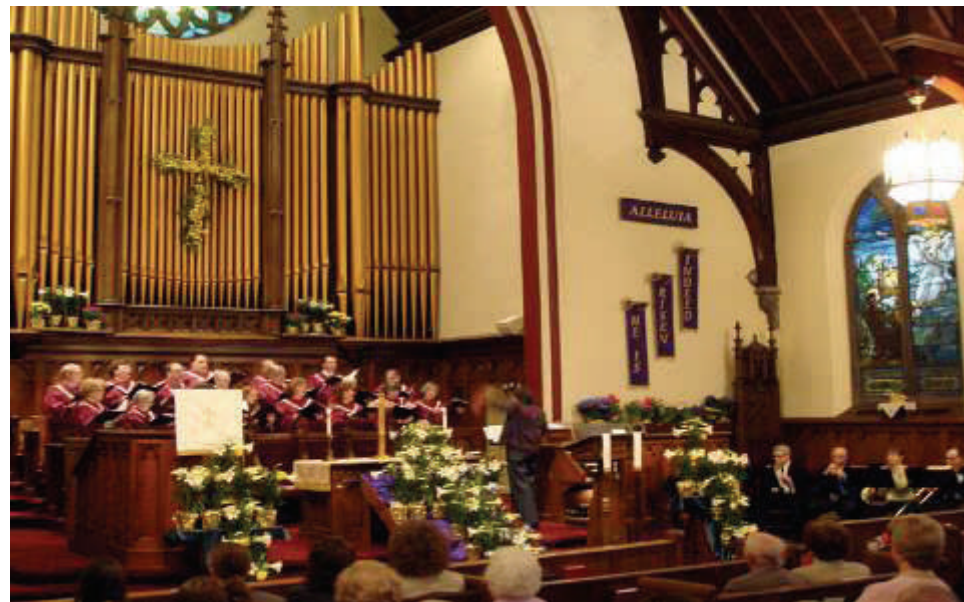
Easter 2007 is celebrated at our church.