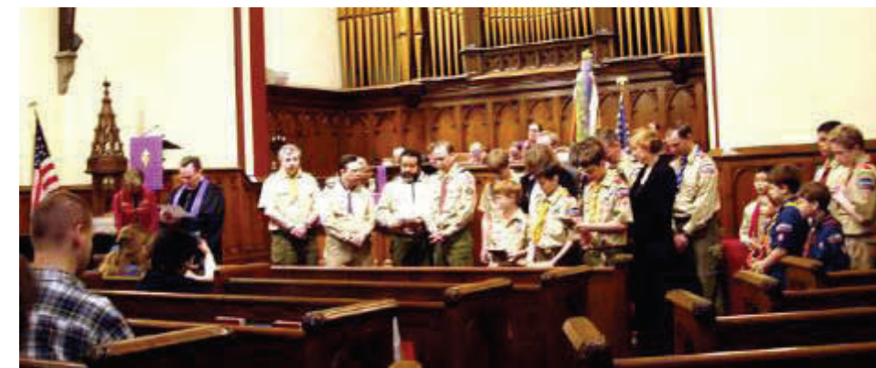
Scout Sunday was a special day with the awarding of the God and Country award to three young members of our congregation.