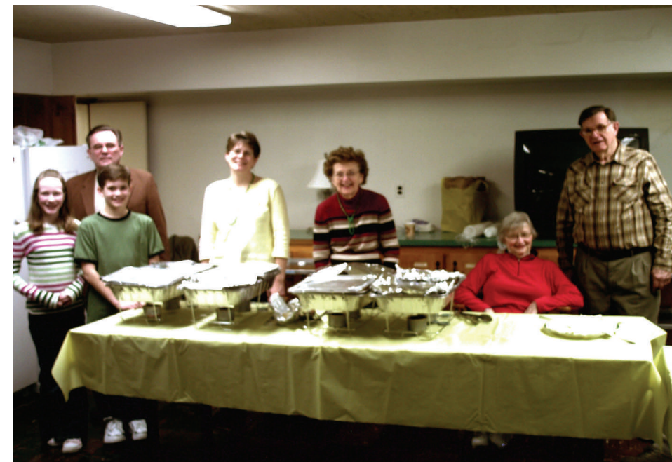
Members of the Fellowship Committee getting ready to serve guests on Shrove Tuesday at the Annual Shrove Tuesday Pancake supper.

"For I was hungry and you gave me food, I was thirsty and you gave me drink."